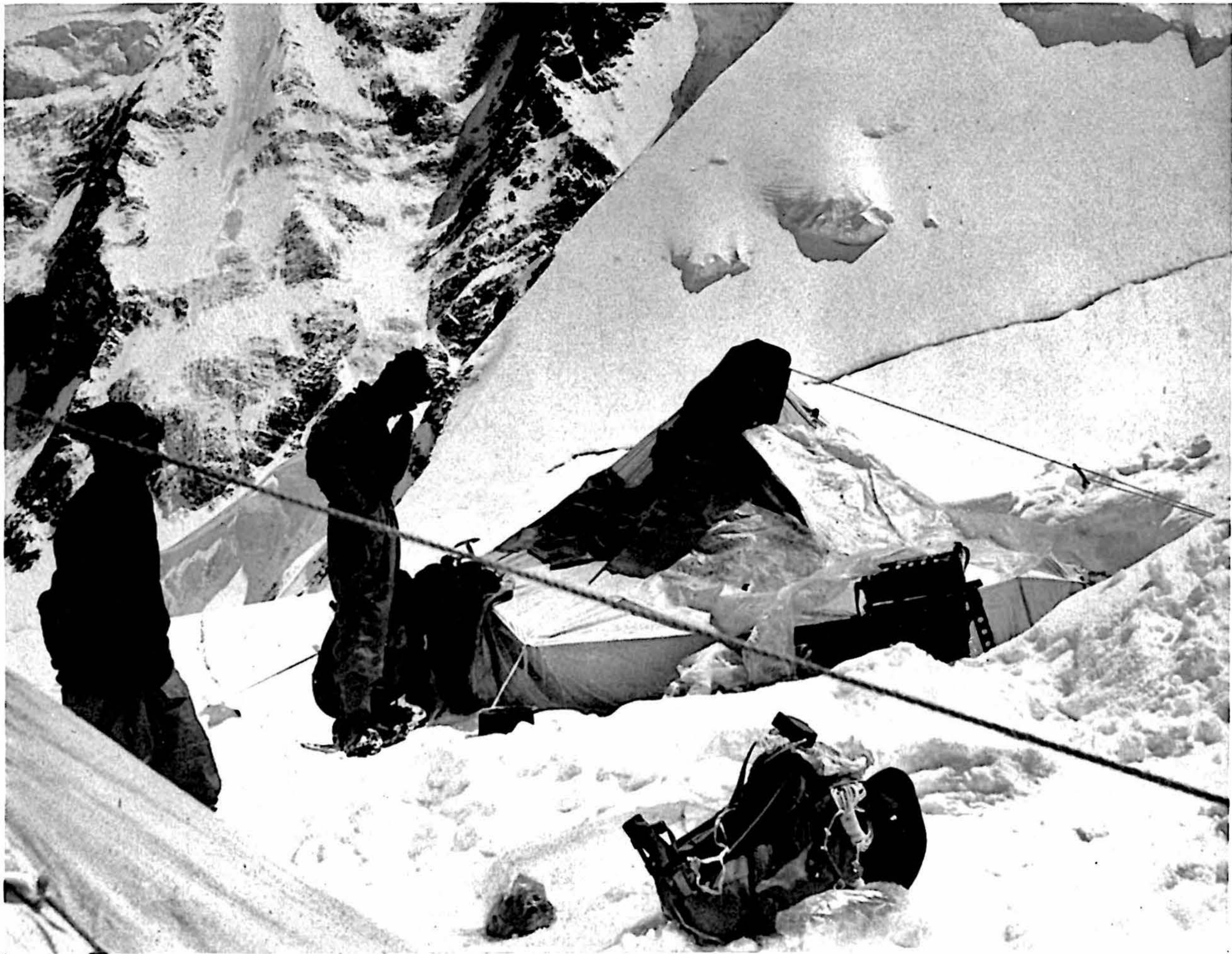
CAMP IV, 19,000 FT. THE SNOW FACE OF THE MONK'S HEAD IS SEEN IN THE RIGHT BACKGROUND.