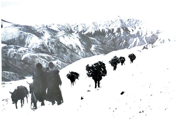
Donkeys carrying firewood. Wood is a major export from some valleys and the remaining scrub is under considerable threat, especially in view of the damage already caused by heavy goat browsing.

in 1977 and are undoubtedly higher than that by now. In particular, these increases have put intense pressure on the relatively accessible Indus valley, where the population increase has been highest and where the tourist pressure is greatest. Not surprisingly, there are already signs that excessive pressure is being exerted on this fragile cold desert ecosystem and there is an urgent need for adequate environmental protection measures.