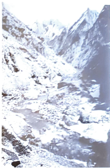
A typical steep sided barren valley — good bee habitat (Ben Osborne)