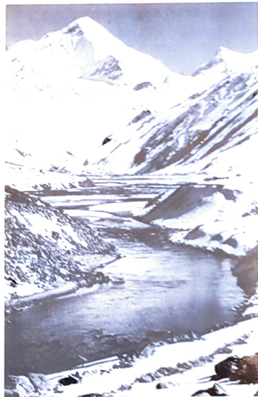
The Suru Valley and the highest peak in Ladakh — Nun Kun, 23,500 ft

and if caught by the villagers may be killed. Just as often however, they are simply driven away with shouts and stones, since many villages are without guns. This stems from one of the tenets of Tibetan Buddhism, namely that any taking of life is sinful, and also explains why in most of Ladakh