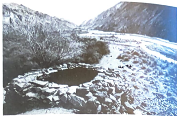
Wolf trap—not used very often these days. A donkey is used as bait and the wolf is stoned to death once it is in the trap. The trap lip is overhanging so that neither the donkey nor the wolf can escape (Ben Osborne).

there are few professional hunters. However, in the Suru valley and in one area of Zaskar hunters are much more active, largely from the Moslem minority there, who have no religious inhibitions about killing. We were told of five occasions in the last five years when snow leopards had been shot in the Suru valley. This activity is illegal but the rewards are high since a pelt is worth up to 2500 rupees (£160) in Srinagar or Manali. During the summer snow leopards follow their major prey species, bharal Pseudois mayaur and ibex Capra ibex to the highest ridges and pastures and are never seen.