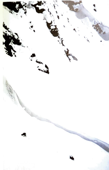
Ibex are often found on steep snow slopes in winter and dig through deep snow to find food. They are often killed by avalanches.