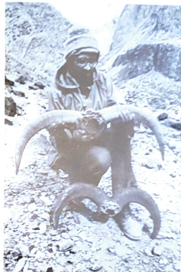
Bharal horns like these often adorn religious carms. They are probably taken from animals which died naturally.

regularly shot and now only very few, if any, survive, in the area of Hanle.